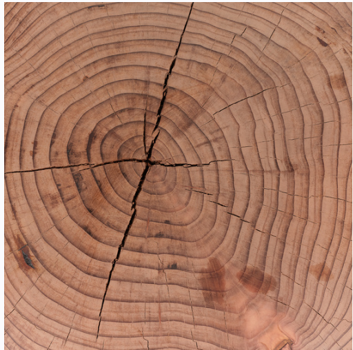
C.O., 2023 Redwood (salvaged) 33 inches diameter