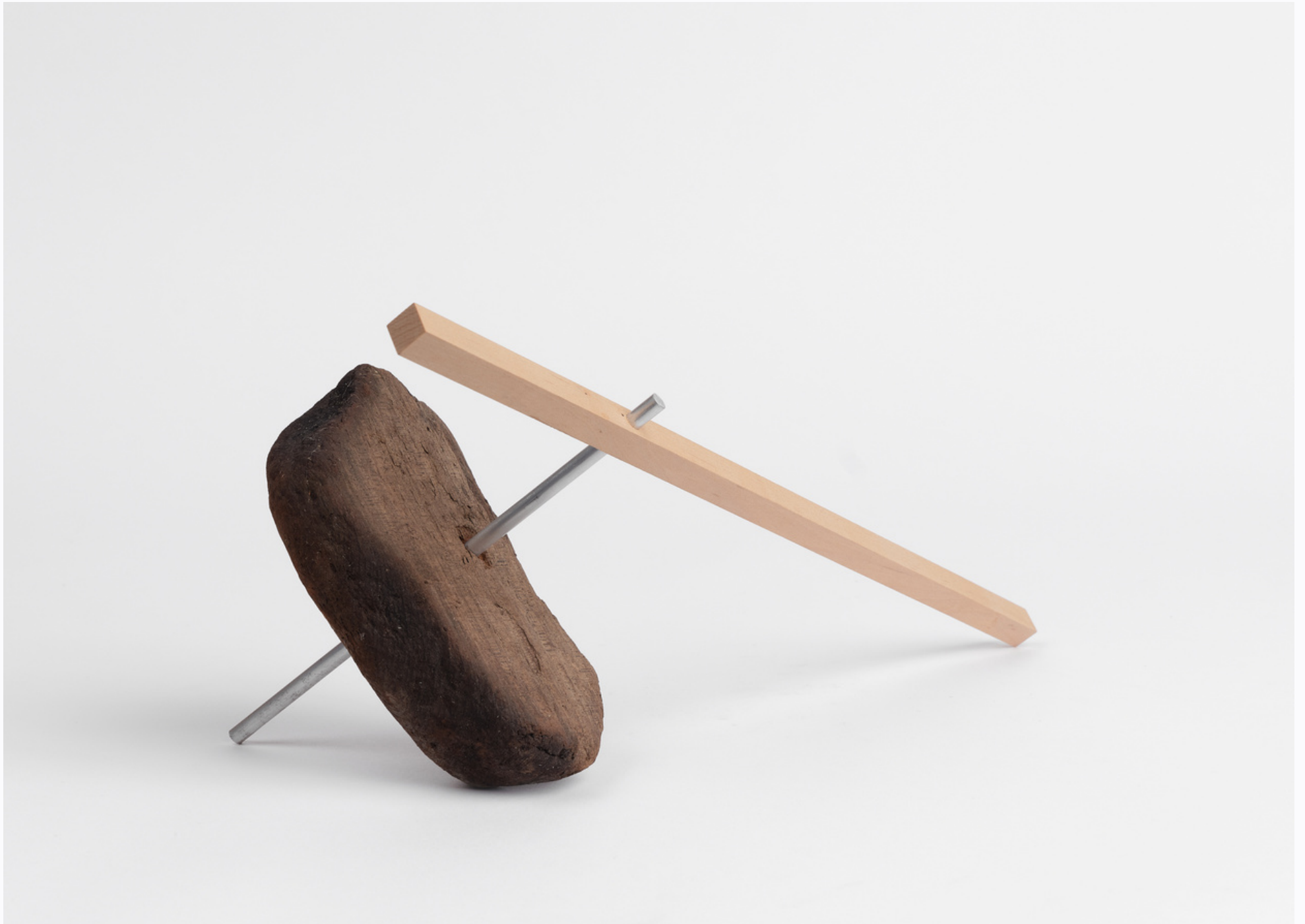
Untitled (x y z for T) , 2021. Aluminum, Redwood and Poplar. 16 ½ x 3 x 7 inches