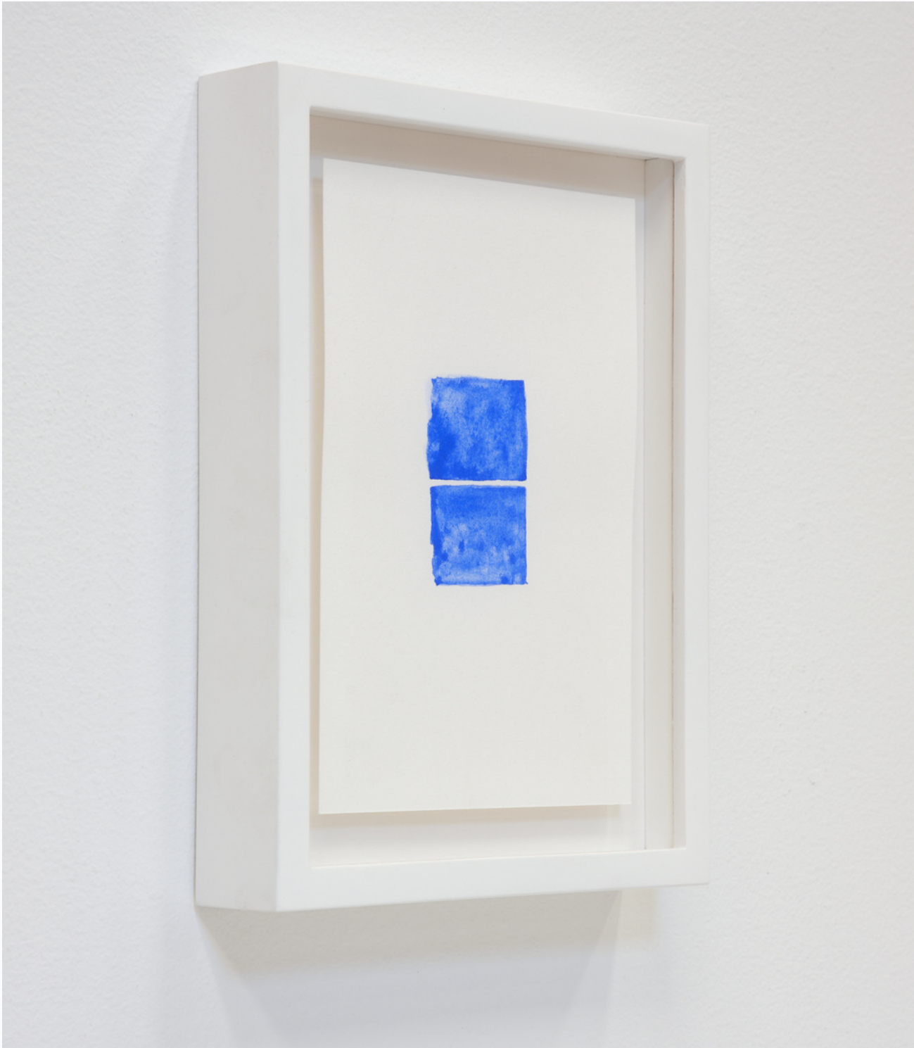
Blue (On Exactitude in Science, farmoon 135) Watercolor on paper 5 \frac{3}{8} x 7 \frac{3}{8} inches (framed)