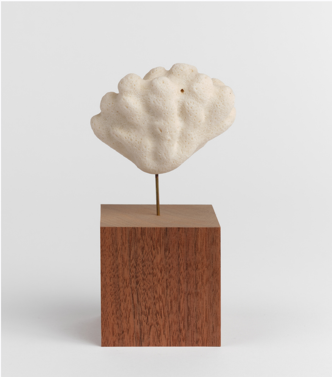
Blue (On Exactitude in Science) , 2019 Coral, Brass, and Walnut 7 x 3 \frac{3}{4} x 3 inches