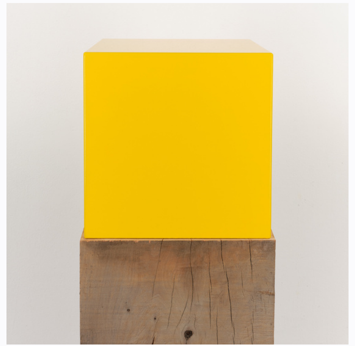
Untitled , 2023. Cypress (salvaged), enamel paint and fiberboard. 58 x 10 x 10 inches