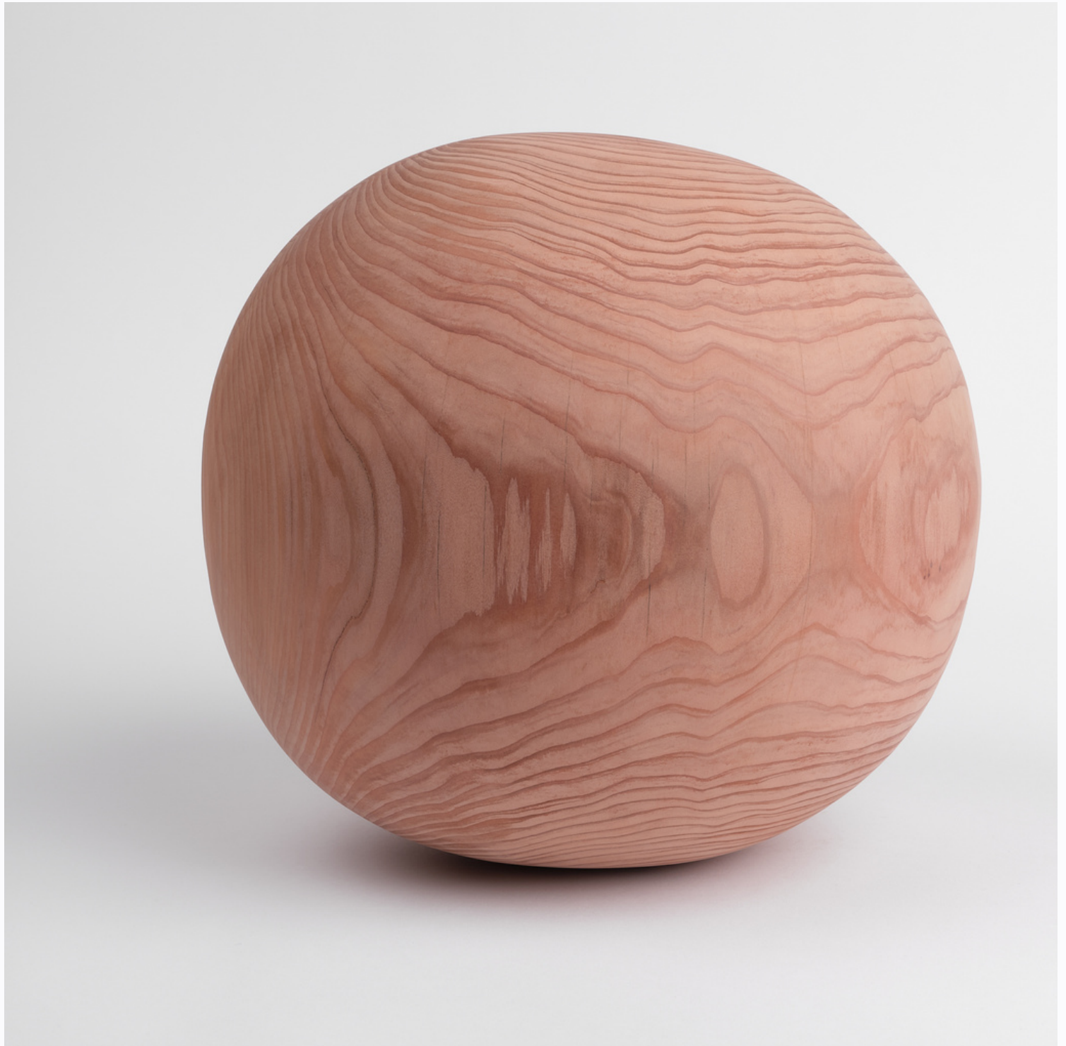
C. O., 2023 Redwood (salvaged) 12 inch diameter