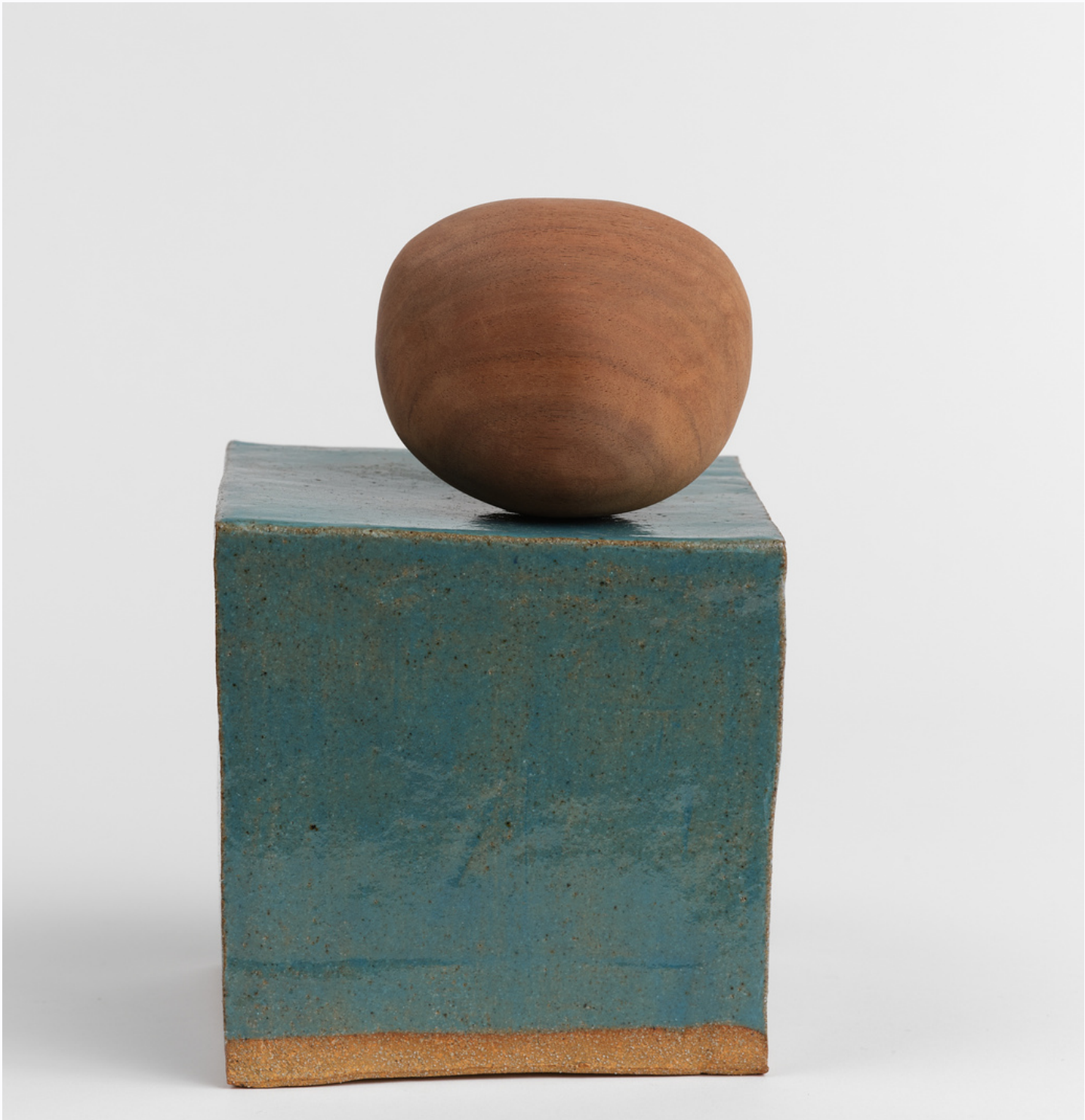
Untitled , 2022 Glazed ceramic and Walnut 7 ¼ x 5 ⅝ x 5 ⅝ inches