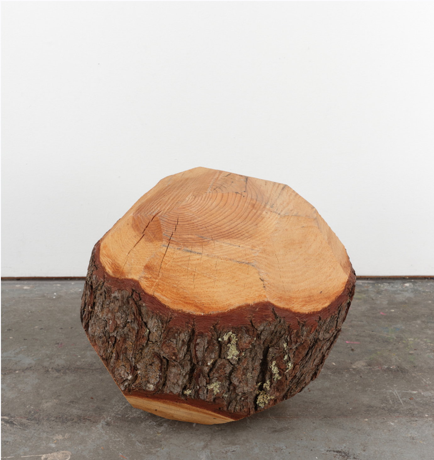
C.O., 2022 Douglas Fir (salvaged) 16 inches diameter