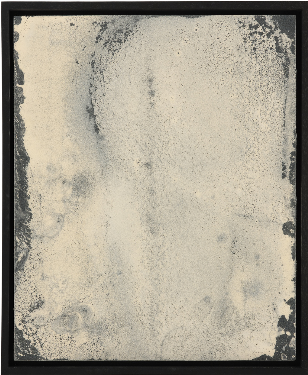
Untitled (Truing the Whetstone) , 2022 Ceramic and sandpaper 10 x 12 inches