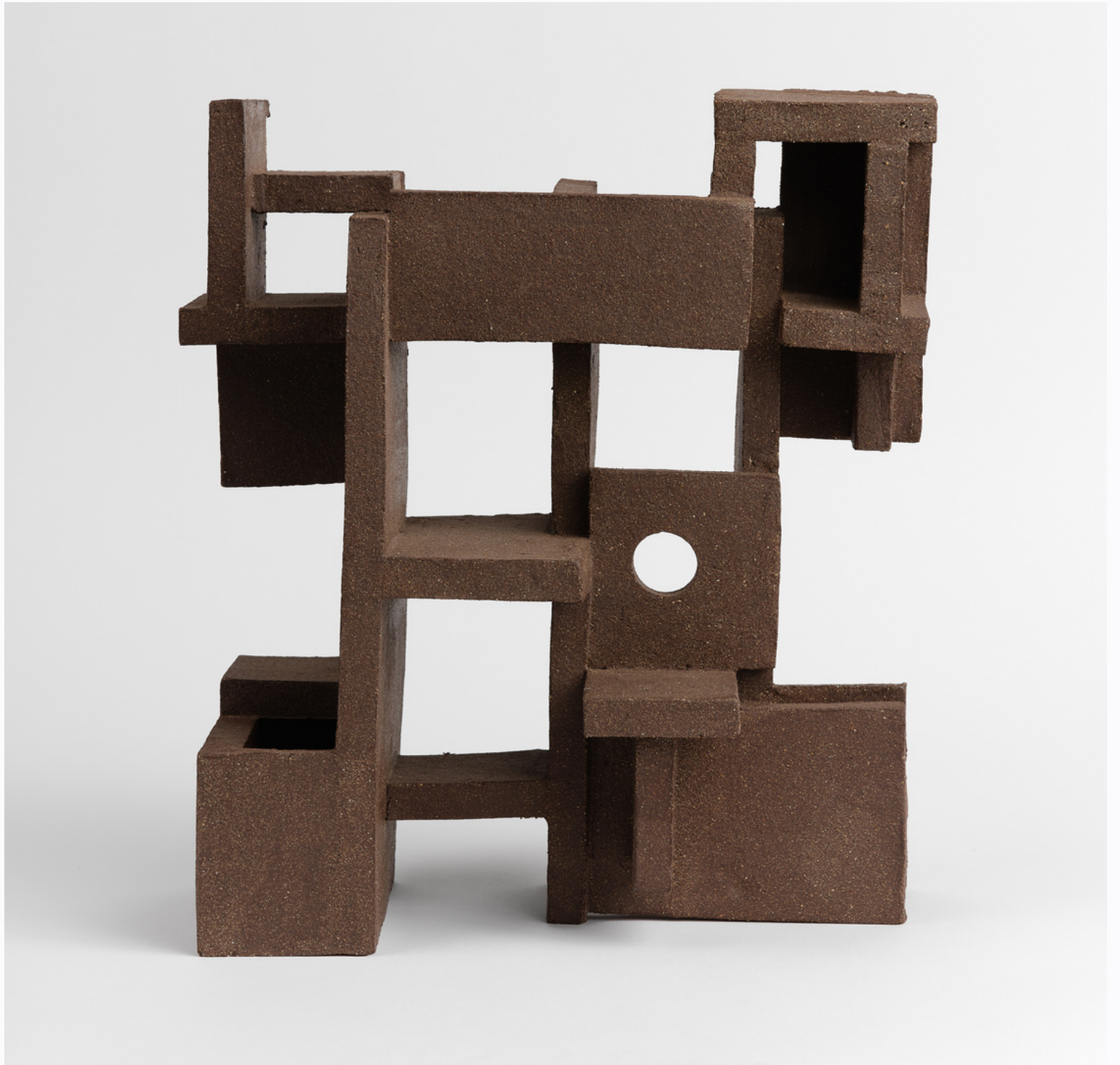
Untitled, 2022 Ceramic 15 x 13 ½ x 6 ½ inches