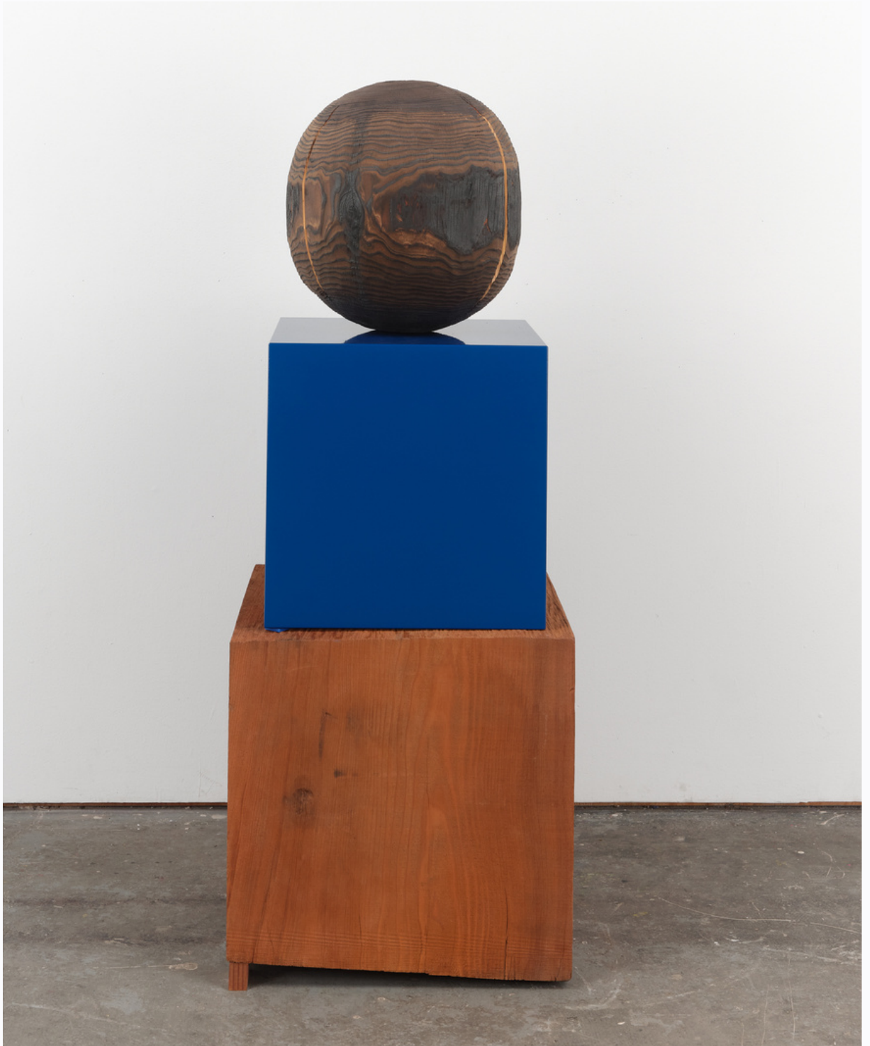
Untitled (An Imaginary bouquet of flowers from my mind) , 2022 Redwood (salvaged), enamel paint and fiberboard 49 ½ x 19 x 19 inches