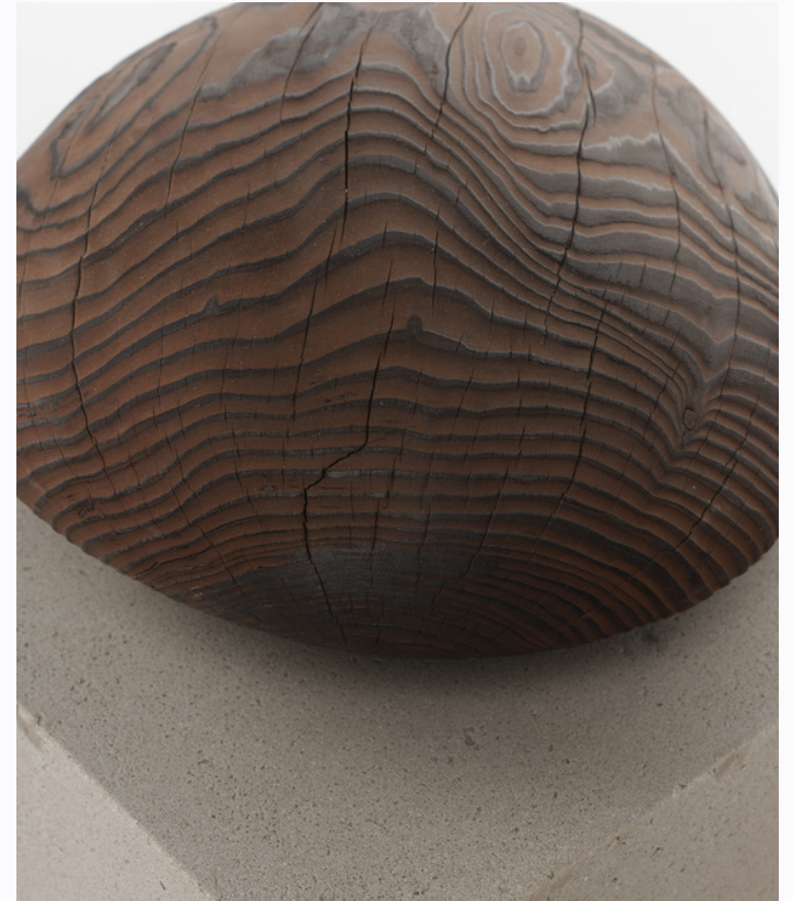
Untitled , 2023. Redwood (salvaged), concrete. 44 x 18 x 18 inches