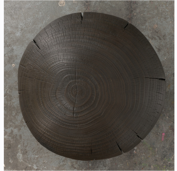
C.O., 2022 Bronze. 12 x 17 ½ inches (H x diameter)