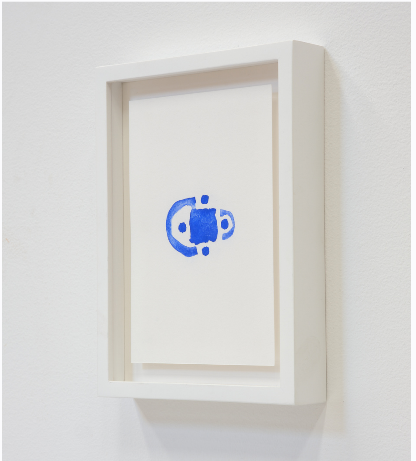
Blue (On Exactitude in Science, farmoon 146) Watercolor on paper 5 \frac{3}{8} x 7 \frac{3}{8} inches (framed)