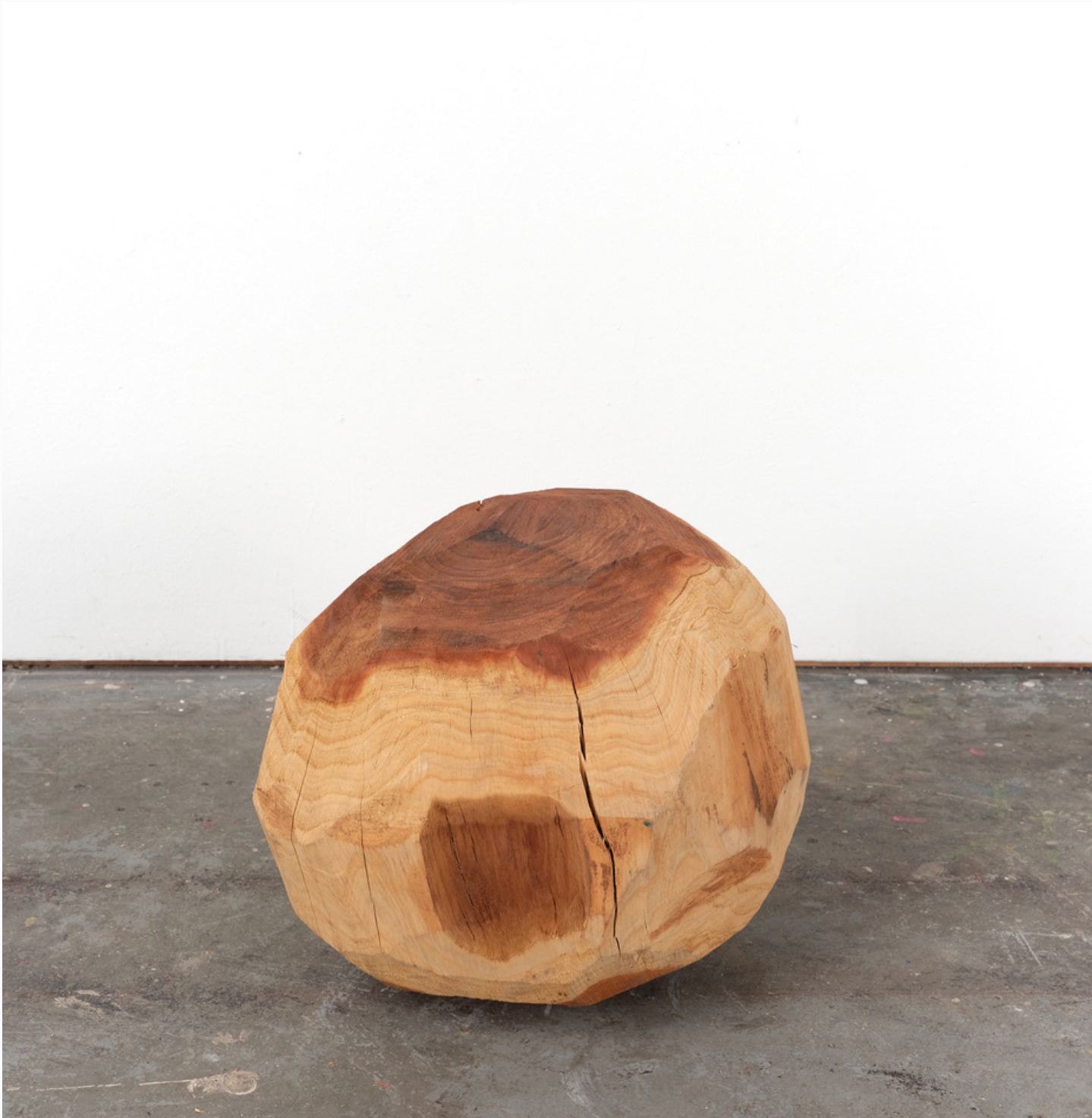
C.O., 2022 Redwood (salvaged) 15 inches diameter