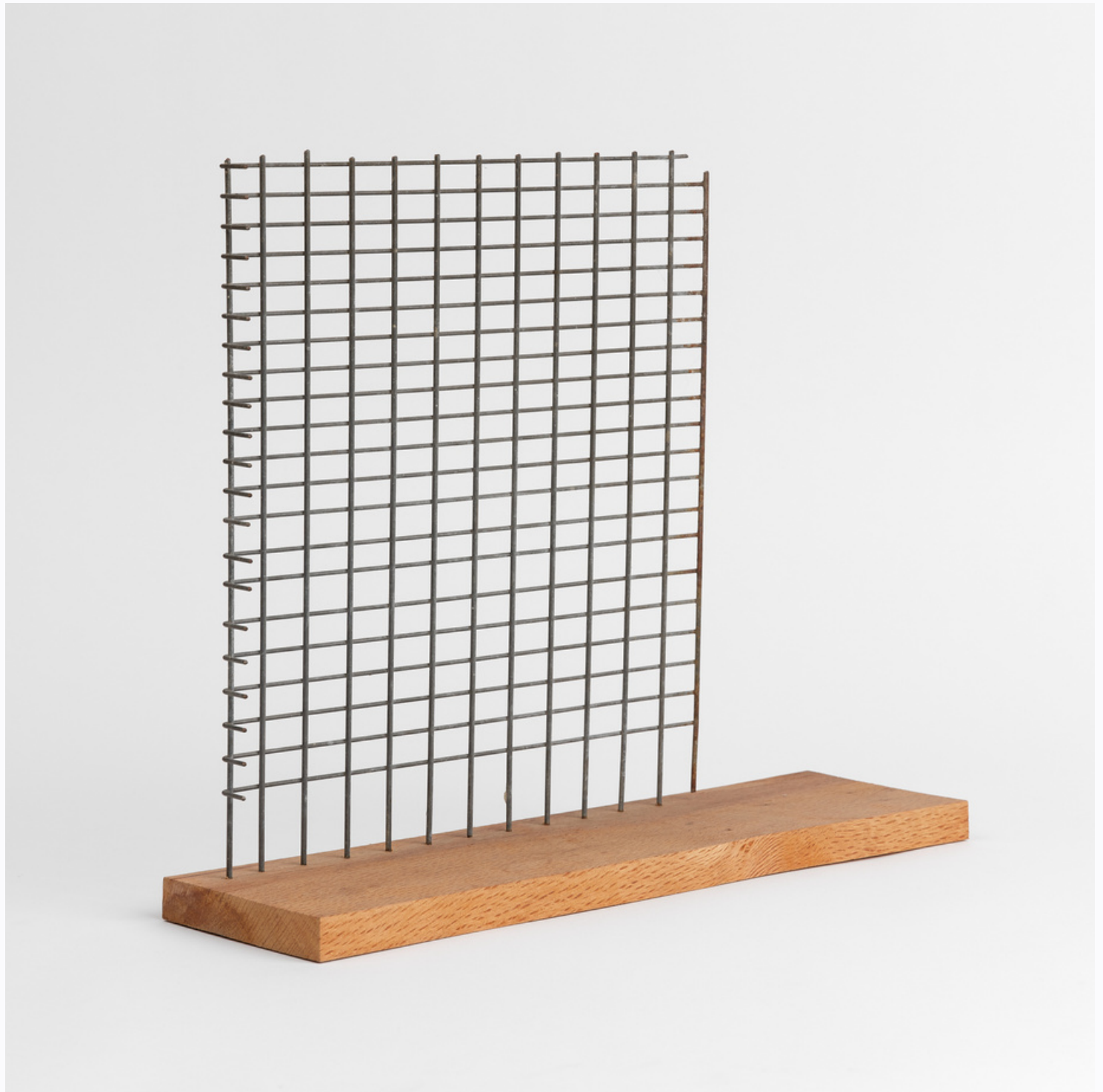
Untitled (leavings) , 2021 Galvanized steel and Oak 16 ½ x 13 ⅞ x 4 ½ inches