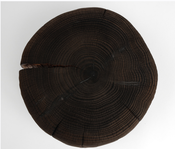
C. O., 2022 Redwood (salvaged) 7 x 13 inch diameter